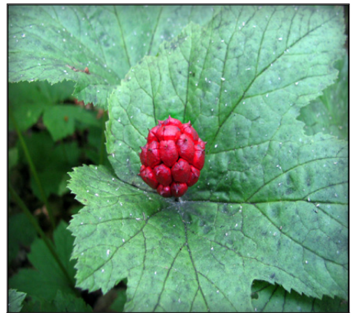
Goldenseal berry in fruit

Hydrastis canadensis L., a member of the Ranunculaceae family, is native to North America with a natural range from southern Quebec to northern Georgia and west to Missouri. Goldenseal is an herbaceous perennial and can be found growing naturally in rich, densely shaded, deciduous forests. The plant emerges in early spring from buds that overwinter on the perennial rootstock, growing each year to a height of 8 to 14 inches. The mature plant has two or more erect stems, usually ending in a fork with two leaves. The dark-green leaf is palmate shaped with a long petiole and can have five to seven lobes. The margins of the leaves are double-serrated. Leaves can span 3 to 12 inches in diameter and 3 to 8 inches in length. A single greenish-white flower blooms briefly from late April to May, depending upon location. A single green berry-like fruit develops, turning red in July and containing up to 30 black seeds. The seeds, which must always remain moist, may take up to three years to germinate. First-year seedlings have two little round leaves and look very different from the mature plants. The turmeric-colored rhizome and fibrous roots spread horizontally in the soil and can form a dense mat. If not harvested, the oldest parts of the rhizome eventually decay and the newer material continues to grow outward. Throughout this article, the term “roots” will refer to roots and rhizomes together, unless indicated otherwise.