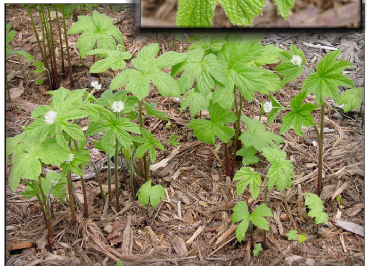
Goldenseal in flower. Shortly after the flowers, the fruit will develop. From the fruit, seeds can be harvested.