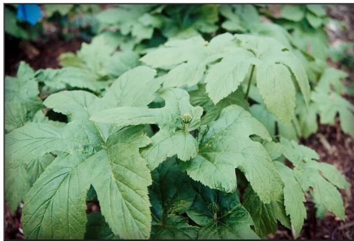
Goldenseal plant with ripening fruit