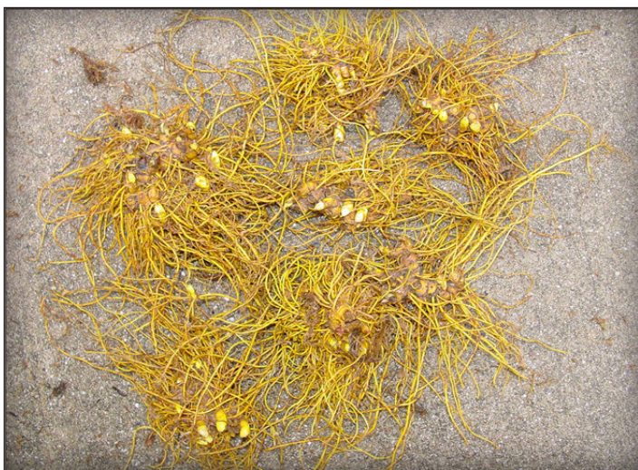
Freshly dug and washed goldenseal roots

Demand continues to exceed supply for high-quality, cultivated goldenseal. Wild-harvested product is meeting the demand requirements of buyers more concerned with the name recognition than bioactive components. Cultivated material represented about 40 percent of the overall supply in 2005. Restrictions on wild harvesting in many areas and the desire for higher