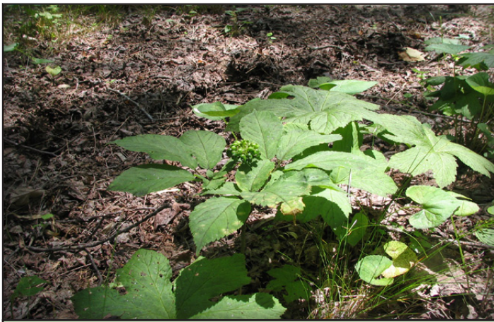
Goldenseal plant with ripening fruit

pulp need to ferment in water until they can easily be separated. The seeds must never be allowed to dry out. When cleaned and rinsed thoroughly, sow the seeds one-quarter to one-half inch deep in a shaded nursery bed, and space the seeds 1 to 2 inches apart. Cover with several inches of leaf mulch to prevent the soil from drying out. Germination of goldenseal seed can be slow, erratic, and unpredictable. It is not uncommon for all or part of a seed bed to take two seasons before germinating. Richo Cech, author of “Growing At-Risk Medicinal Plants,” recommends waiting to transplant the seedlings into permanent production beds until they are two years old and have formed a rhizome.