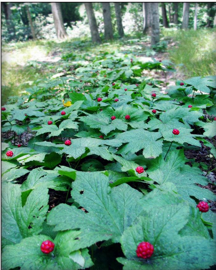
Wild-simulated Goldenseal bed.

Goldenseal can be propagated from rhizome pieces, root cuttings, or seed. To propagate from seed, the fruit must be harvested as soon as it is mature, then processed by carefully mashing the fruit to separate out the seeds. This process can take several days, as the seeds and