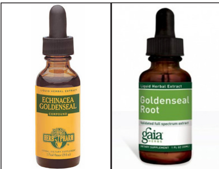
Goldenseal tinctures from Herb Pharm (right) and Gaia Herbs (left). It is common for goldenseal extracts to be combined with other plant extracts, such as Echinacea.

The high demand for goldenseal has put native populations in serious decline throughout its range. A CITES permit is required to export goldenseal. Commercial interest in this product has been high and is expected to remain so. Goldenseal trades at a higher price bracket than most plants. In recent years, more efforts have been made to encourage farmers to cultivate this high-value crop. With more cultivation efforts occurring, supply will slowly increase but not at a rate consistent with demand, which should keep prices in a relatively high bracket.