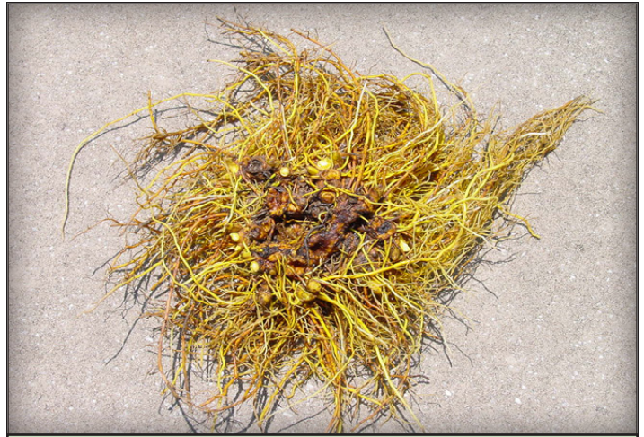
Freshly dug and washed goldenseal roots

Native Americans used goldenseal in a variety of ways, including as a general antiseptic and as a treatment for snakebites. Renewed interest from herbalists in the United States in the 1990s sparked new demand for this material in Europe. Modern medicinal uses for goldenseal include the treatment of nasal congestion, digestive disorders, inflammation, and AIDS. Goldenseal is often referred to as a synergistic herb, meaning when taken with other herbs, it increases their efficacy. Goldenseal and echinacea make up a common combination formula.